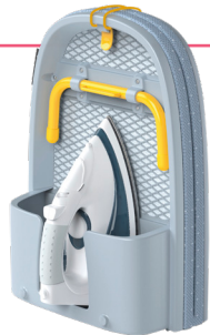
pocket folding ironing board $90, us.josephjoseph.com