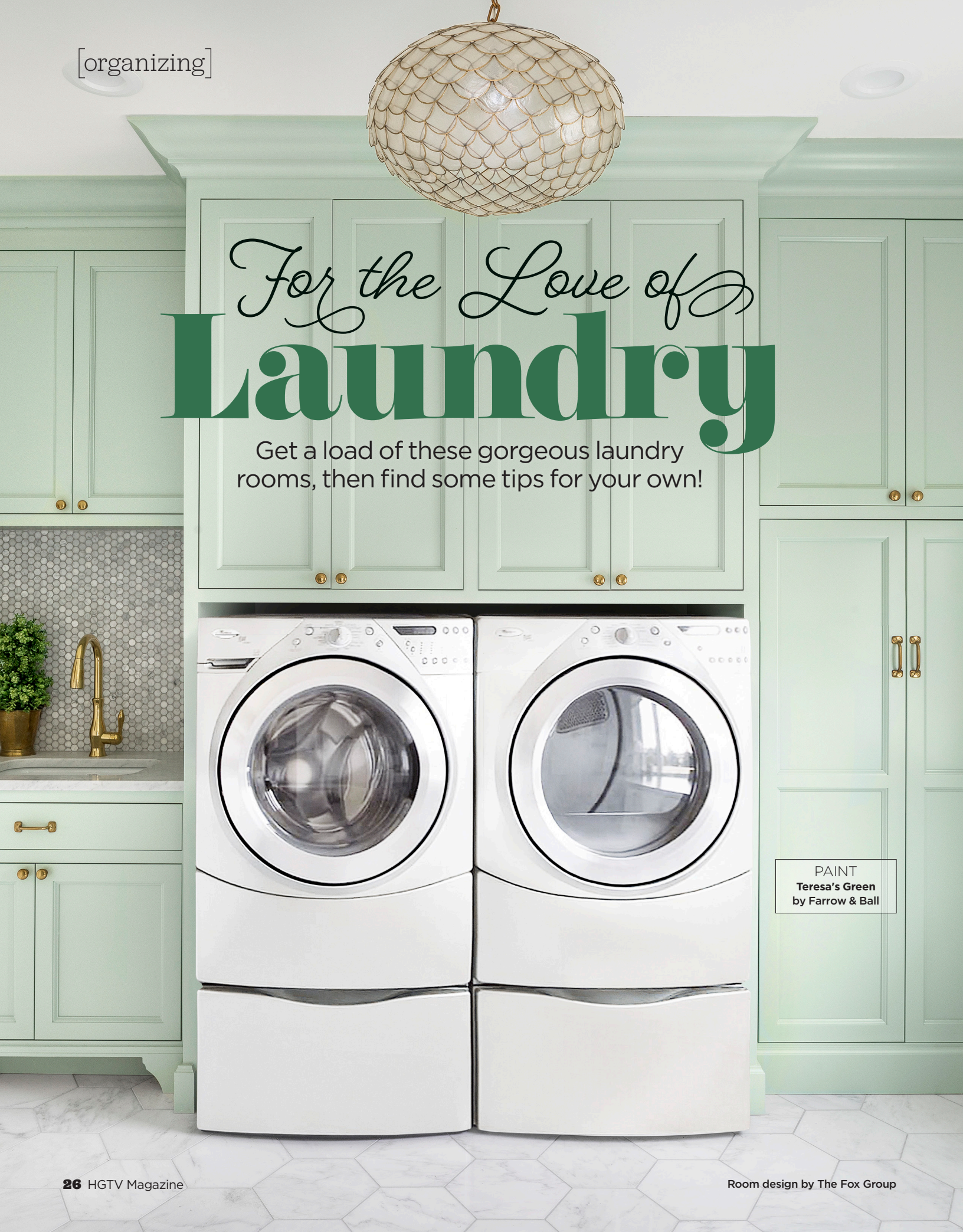
PAINT Teresa's Green by Farrow & Ball

Get a load of these gorgeous laundry rooms, then find some tips for your own!