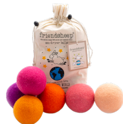
tropical sunset dryer balls $32 for 6, friendssheepwool.com