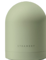
pilo 2 fabric shaver $65, steamery.us