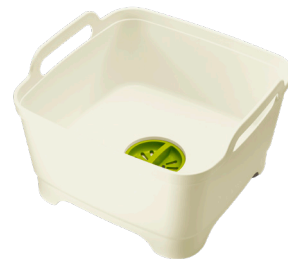
washing-up bowl $22, us.josephjoseph.com