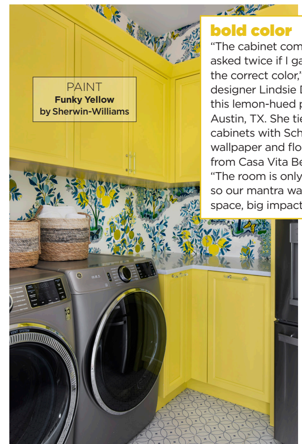
PAINT Funky Yellow by Sherwin-Williams