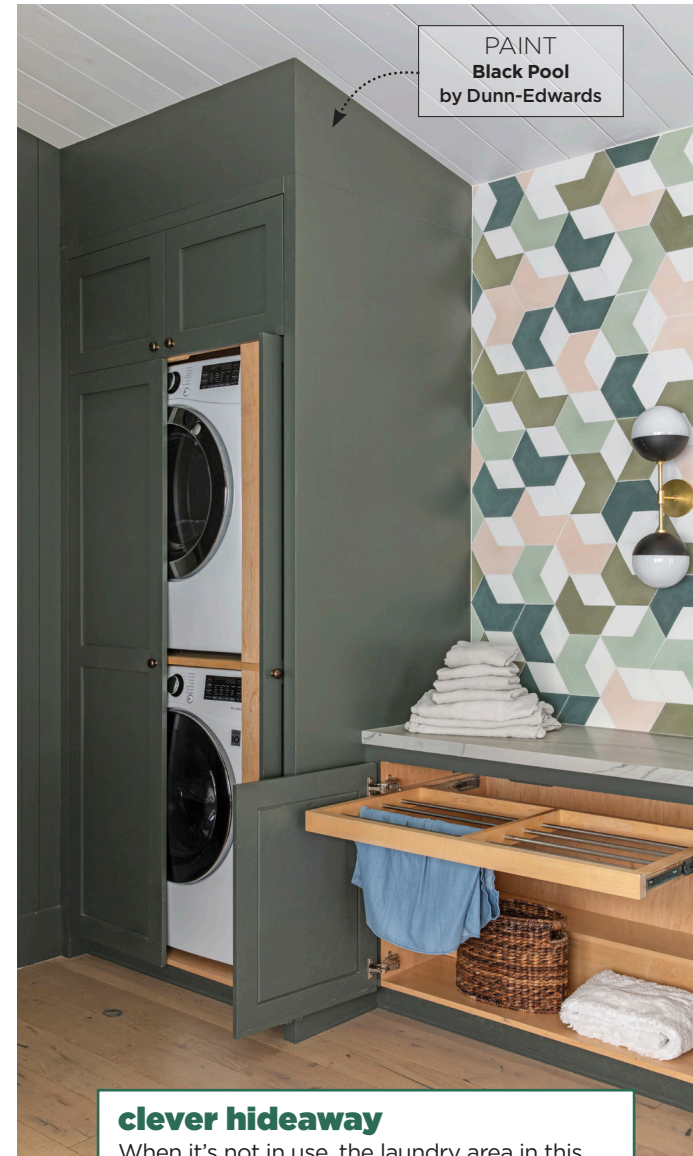
PAINT Black Pool by Dunn-Edwards