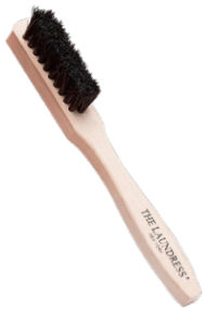
stain brush $14, thelaundress.com