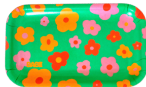
that '70s catchall tray Burner Babe, 6" x 10", $18, urbanoutfitters.com