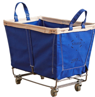
mobile canvas bin 20" tall, $198, anthropologie.com